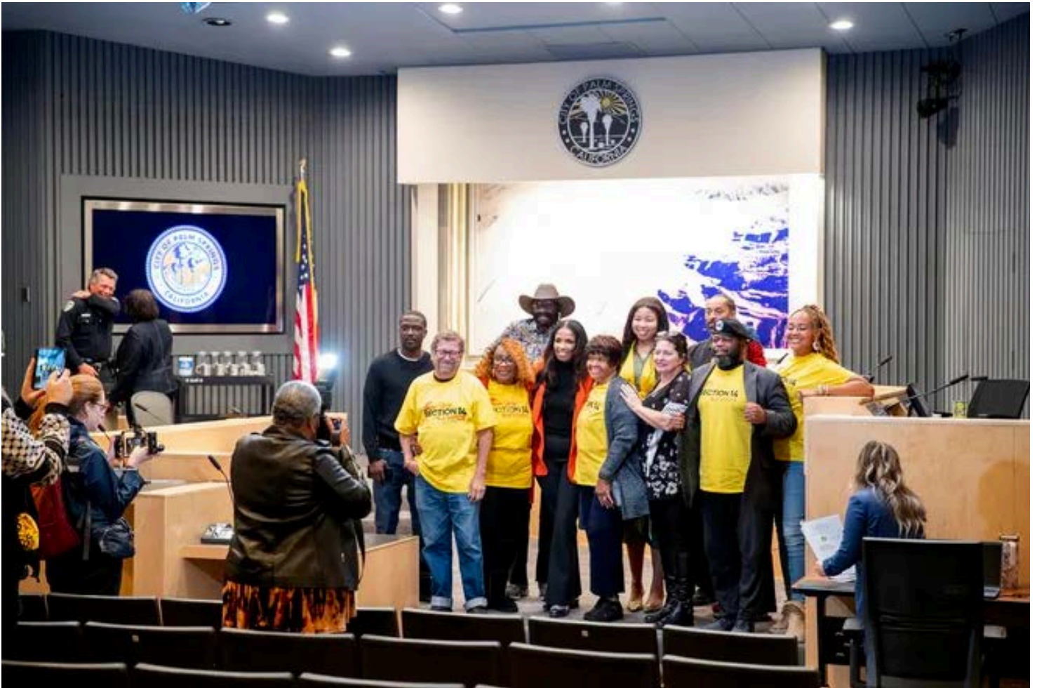
Section 14 Survivors group and supporters gather for a photograph after Palm Springs City Council approve $5.9M Section 14 settlement in Palm Springs, Calif., on November 14, 2024.