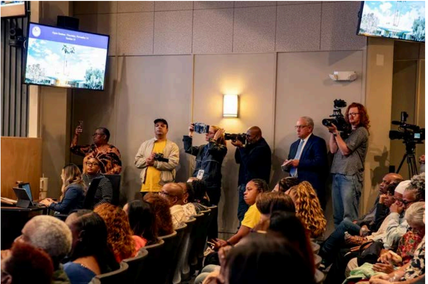
People listen ahead of the city council vote on a tentative settlement offer of $5.9 million to the Section 14 Survivors group in Palm Springs, Calif., on Thurs., November 14, 2024.