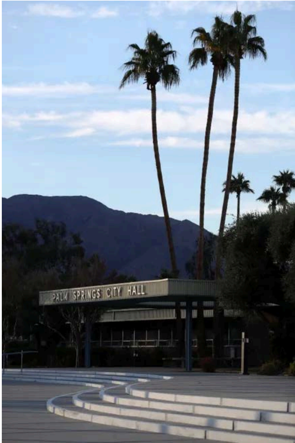
Palm Springs City Hall on November 14, 2024.